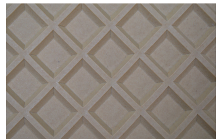
Wear resistant Elastoflex with A79 profile